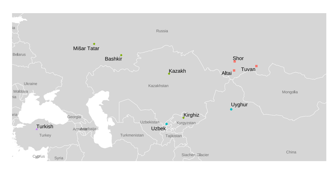
Figure 2 Map of extant Turkic languages addressed in the paper (made using ggmap, Kahle & Wickham 2013, in R, R Core Team 2019)